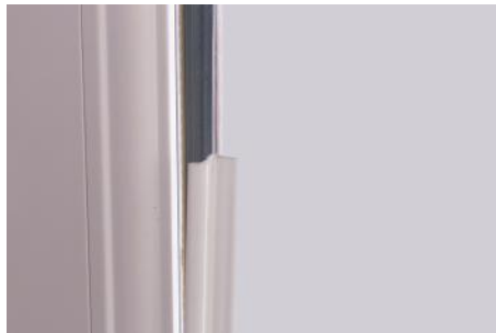
8. Place the side profile* against the side frame with flat face towards the glass and the notch to the bottom.