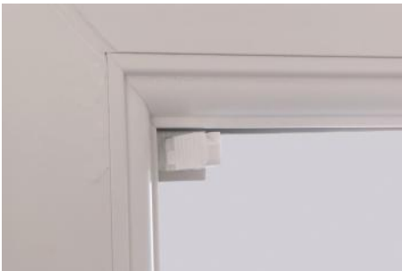
4. Check bracket is squarely secured. Repeat both sides.