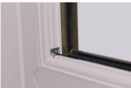
10. Slide bottom slot of profile over the bottom bracket. Repeat both sides.