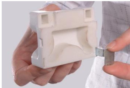
5. Position bottom fixing bracket into the purpose made slot in the Bracket Insertion Tool.