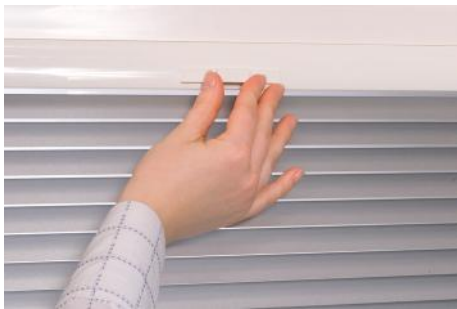
19. Check the blind operation, raise/lower and open/close is satisfactory.