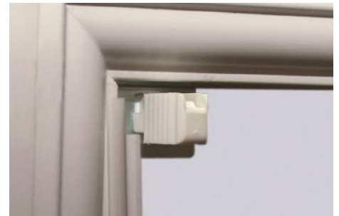
9. Slide the top edge into the slot of the bracket. Push profile fully into position.