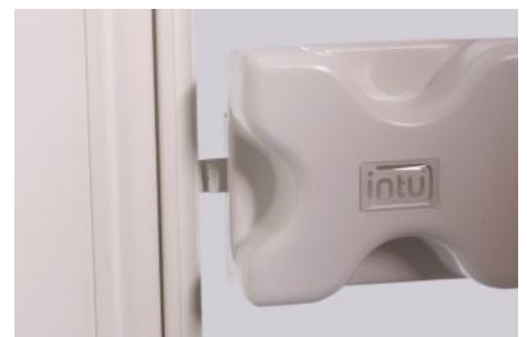
12. Press home using the insertion tool. Fully located the clip will sit over the side profile.