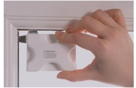
3. Position bracket behind rubber bead and carefully push the metal legs behind the bead.