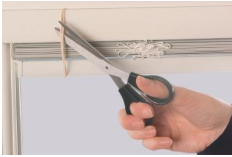
16. Snip off the rubber bands and carefully lower the slats to the bottom frame.