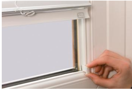
17. With cord at bottom of bracket, slide onto clip. Repeat both sides.