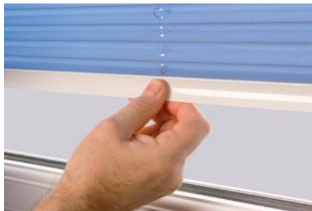
18. To align the bottomrail horizontally, simply pull it into the position desired. It will stay in position under tension from the cords. Check the blind operation, raise/lower is satisfactory.

If you require further advice or more information on INTU® blinds please call 0141 814 3508 or email info@eclipse-blinds.co.uk