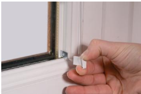
17. With cord at bottom of bracket, slide onto clip. Repeat both sides.

The steps required to fit INTU® Pleated or Cellular blinds are the same as for INTU® Venetian up to step 16. From step 17 on, follow the instructions below