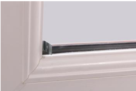
7. Check bracket is vertically secured. Repeat both sides.