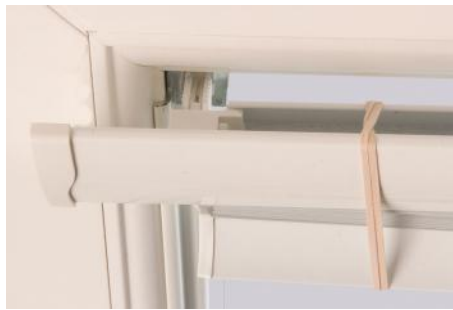
14. With rubber bands in place, align the headrail end cap slot with bracket arms.