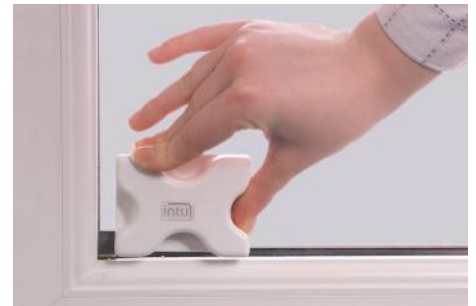
6. Position bracket behind rubber bead and carefully push the metal leg behind the bead.