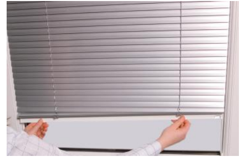
18. To align the bottomrail horizontally, simply pull it into the position desired. It will stay in position under tension from the cords. Align bottomrail to the horizontal.