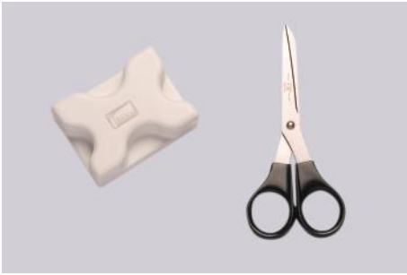
1. Fitting tools required include scissors and Bracket Insertion Tool (TP483)