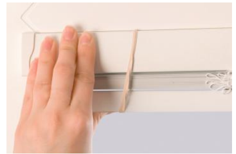
15. Ensure headrail is correctly aligned and firmly press home.